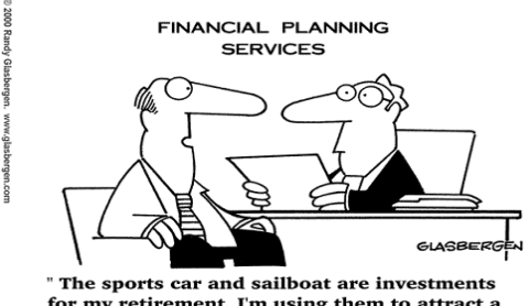
for my retirement. I'm using them to attract a younger woman who can support me in my old age.

It has surprisingly been a huge undertaking to add these products to our range. We are extremely careful with advice we give to our clients and have done copious amounts of research to ensure that we have a full and comprehensive product range to offer you. Many of you have requested these features of life, trauma and other various insurances covering the mortgages you have taken, be added to our suite of offerings. Hoping the full suite may be available in the new year. We will send you separate correspondence when this is launched. Thank you for your patience.